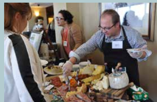
Above lower: Place setting for tasting event paired five different wines with artisan cheeses and local chocolate confections.