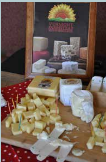
Delicious cheeses and jams for sampling provided by Vermont Farmstead (left) and Mercantile Denver (below).